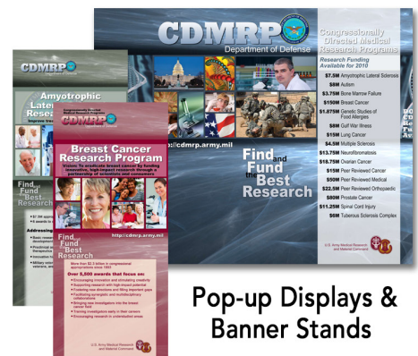
Pop-up Displays & Banner Stands