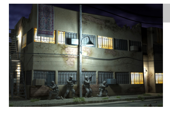
RED : Has the Advantage of Concealment and Surprise