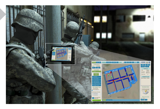
BLUE : Full Building Interior Situational Awareness Before the Mission